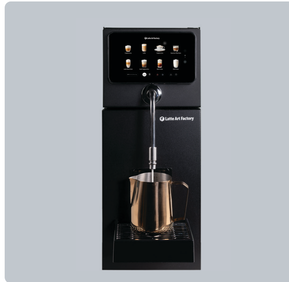
LAF Classic – full unit on counter