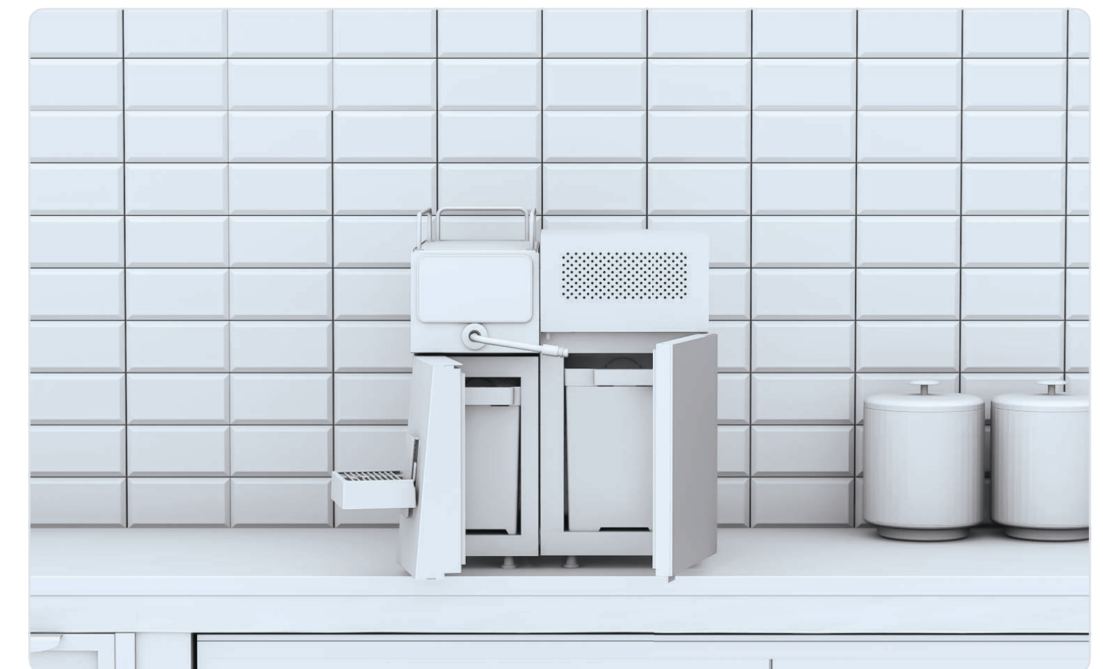
Extra fridge setup: 2x 1 gallon containers